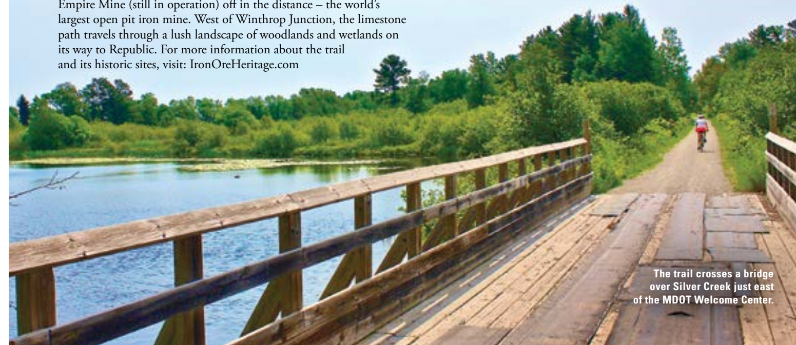
The trail crosses a bridge over Silver Creek just east of the MDOT Welcome Center.

The 11.5-mile Republic/Champion Grade Trail goes from Republic to Champion (former mining towns) on an abandoned railroad grade, ending at the beach at Van Riper State Park. One of our favorite rides, this multi-use trail is exceptionally scenic and a pleasant ride on a fat tire or mountain bike. It travels along the Black River, several creeks and wetlands, passing by Tower Lake and Fish Lake. You'll see lots of beaver lodges and dams along the entire trail. Camping is available at both ends of the trail.