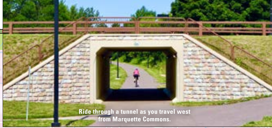
Ride through a tunnel as you travel west from Marquette Commons.