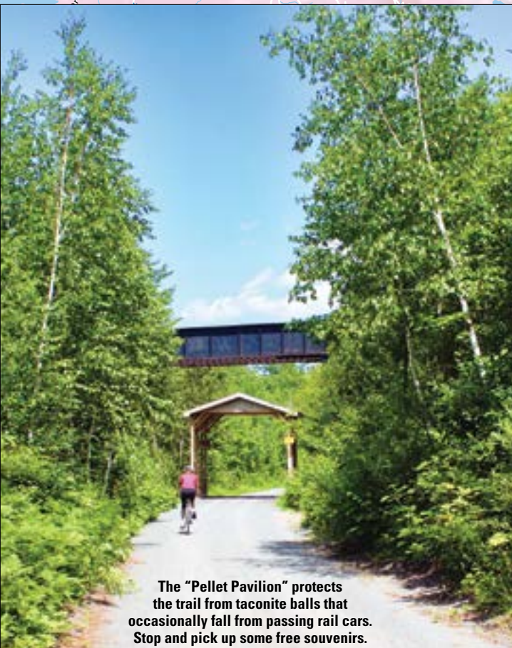
The "Pellet Pavilion" protects the trail from taconite balls that occasionally fall from passing rail cars. Stop and pick up some free souvenirs.